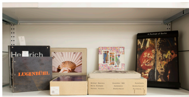
DFK Paris, Library, a selection of precious books.