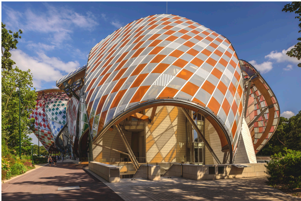
Foundation Louis Vuitton, Architect Frank Gehry, covered with colored stripes of the artist Buren