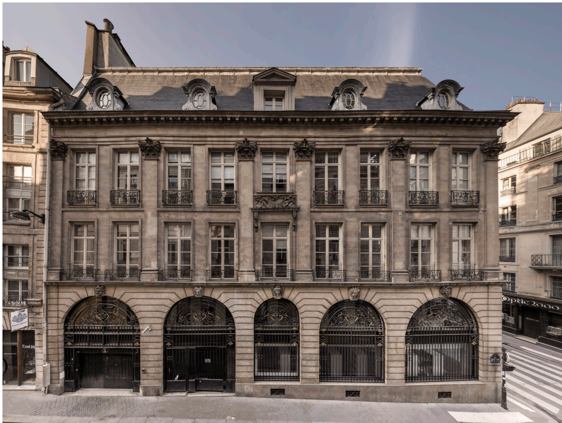
DFK Paris, view of the old entrance on the east side.