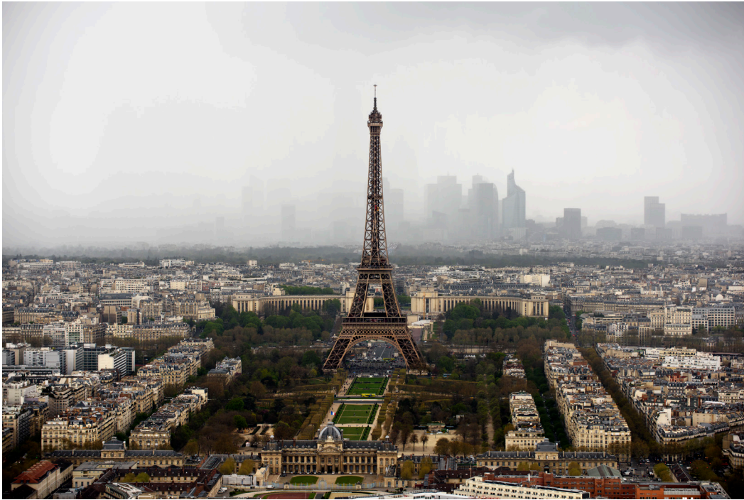
The Eiffeltower and the Champs de Mars

Inscription of the foundry which made the lamps of Pont Alexandre III, and the Iron parts of the Eiffeltower